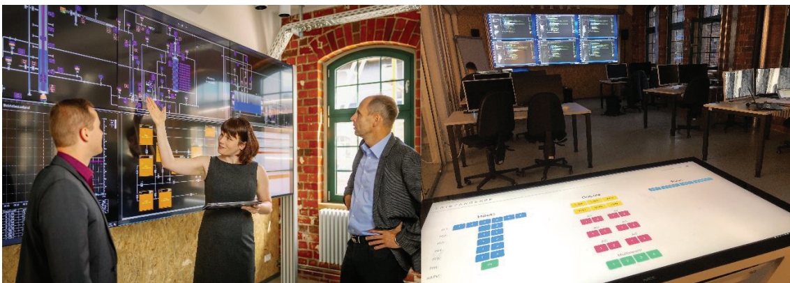
Figure 2: The Interaction Room in action: (left) the display wall used for presentation and discussions and (right) while development of the control apps, showing the LeitstandsApp PWA on a touch table in the back of the Interaction Room, from which the whole setup can be controlled.

To achieve greater flexibility in working with the KVM technology, we have used an existing API interface of the KVM switch and made it available via a service. Based on this interface, we have developed two mobile apps (a Progressive Web App (PWA) and an Android app) to control our premises. With the help of these apps, the user is made free from the classic control options and, due to the flexibility gained, has more degrees of freedom in the individual control of the specific technology.